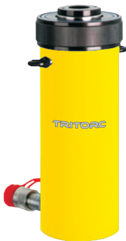
Capacity: 13-95 ton Stroke: 42-155 mm Max. Pressure: 700 bar